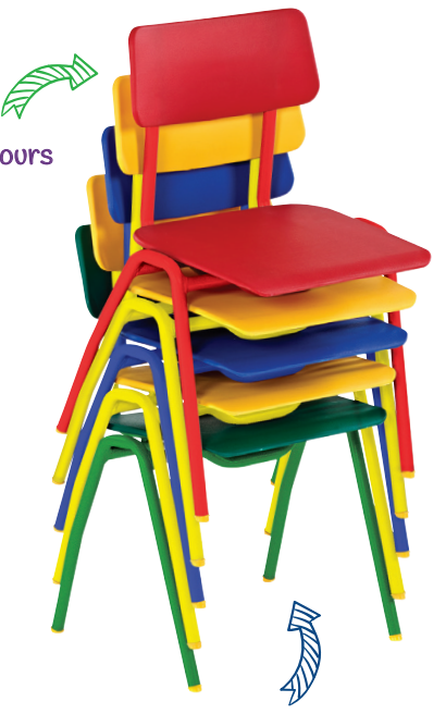
Unbeatable and durable frame design